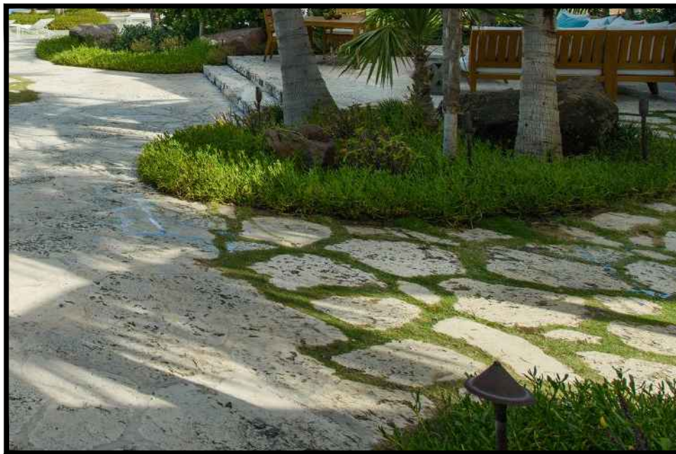
CPTED PRINCIPLE No.4 MAINTENANCE THE SELECTED HARDSCAPE MATERIALS ARE EASY TO MAINTAIN BY MAINTENANCE STAFF. THE FACILITY IS EXPECTED TO BE MANNED FULL TIME DURING OPERATING HOURS ALONG WITH THE USE OF THE CITY'S CCTV NETWORK.