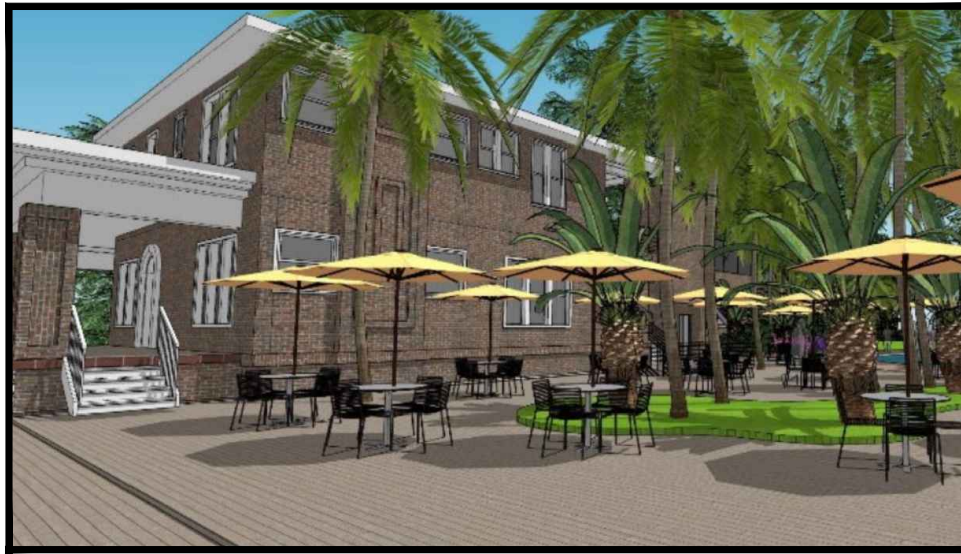
CPTED PRINCIPLE No.2 NATURAL ACCESS CONTROL PROPOSED WALKWAYS AND SIDEWALKS WILL CONNECT THE EXISTING BUILDINGS WITH ALL AREAS OF THE BOTANICAL GARDEN. THIS WILL PROVIDE CLEAR OPEN-ACCESS TO SIDEWALKS. LANDSCAPE ALONG THE WALKWAYS WILL CLEARLY GUIDE PEDESTRIANS TO AND FROM ALL ELEMENTS OF THE GARDEN.