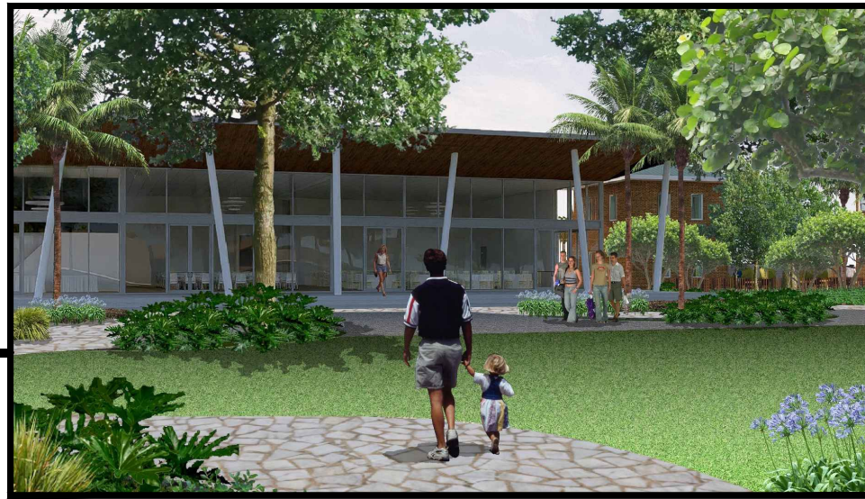
CPTED PRINCIPLE No.1 NATURAL SURVEILLANCE PROPOSED TREES HAVE A 8' MINIMUM CLEAR TRUNK ALLOWING PEDESTRIANS TO HAVE UNOBSTRUCTED VIEWS IN AND OUT OF THE PARK. CLEAR VISIBILITY IS FURTHER STRENGTHENED BY SHRUB USE. REFER TO PLANT LIST.