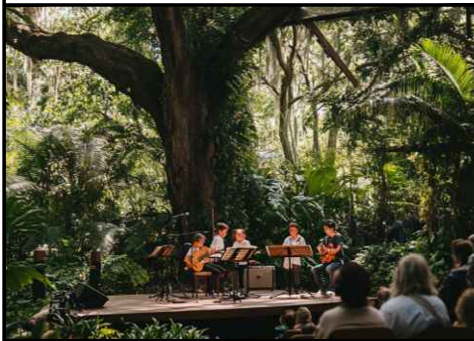
CPTED PRINCIPLE No.5 ACTIVITY SUPPORT ADDITIONAL LANDSCAPE ELEMENTS LIKE BENCHES AND CANOPY TREES WILL INVITE PEOPLE TO LEISURE IN THE BOTANICAL GARDEN INCREASING PASSIVE OBSERVATION AND DECREASING THE RISK OF UNDESIRABLE ACTIVITIES. THIS INTENDED PASSIVE OBSERVATION IS TO BE IN ADDITION TO EVENT ACTIVITIES AND PROGRAMING.